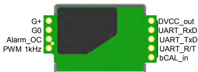
Figure 2. Pin assignment