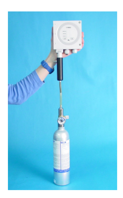
Field Checking in Progress

A field comparison can only check the performance of the transmitter. For accurate calibration and adjustment, the probe or transmitter should be returned to Vaisala Service Center.