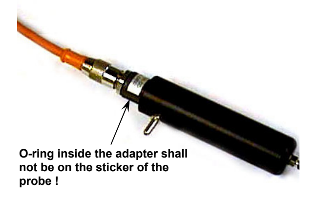
The Field Check Adapter and a GMP220 Series Probe