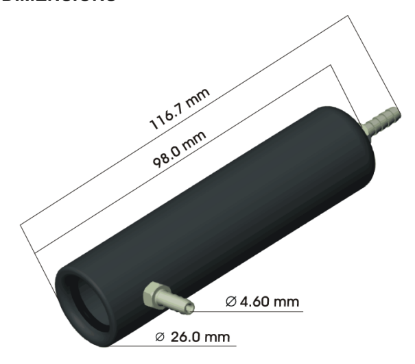
Dimensions of the Field Check Adapter